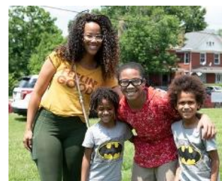
Building Together Block Party